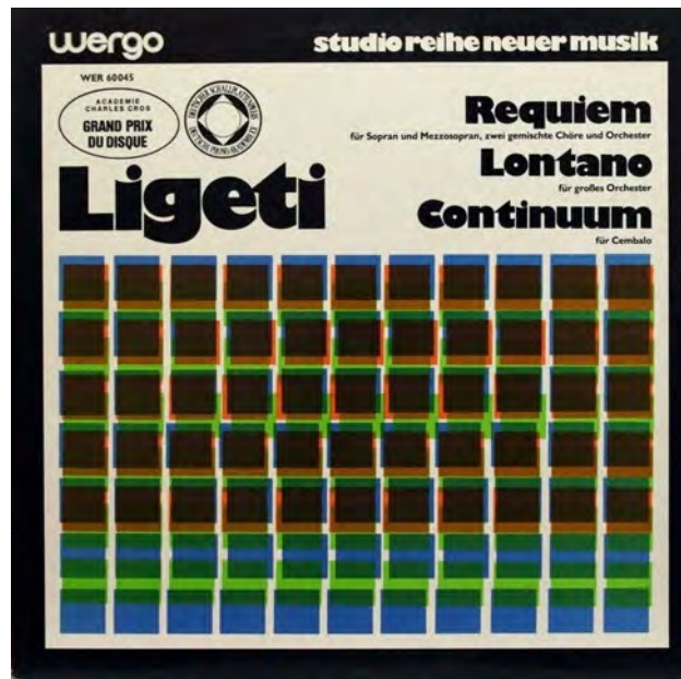
Figure 1: Cover of the LP that started my love for Ligeti's music.

experience, I added Ligeti to my list of musical heroes and was also very proud of myself when, a year later, I pointed out the parallels between Ligeti's micropolyphony and the narrative technique in Nathalie Sarraute's Tropismes during a presentation in my French class. 2